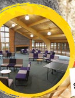
Large Meeting Spaces Available