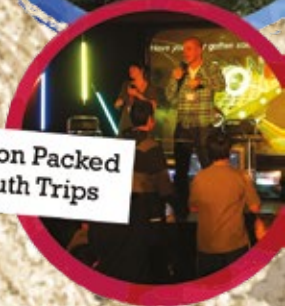
Action Packed Youth Trips

"We are delighted to say that everyone had a great time and enjoyed themselves; the food was amazing... the staff very hospitable and friendly and the accommodation was superb" Bristol City Church